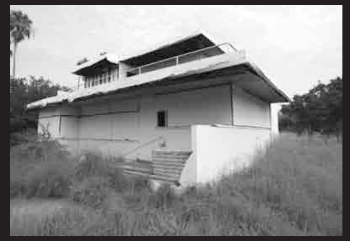
Near collapse after years of neglect, squatting, and water damage, Preservation Texas and the National Trust named the Kraigher House to their "most endangered" list in 2004.