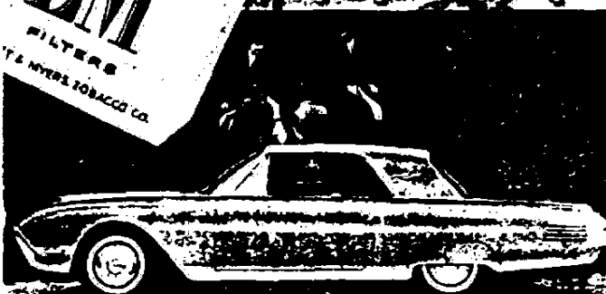
'61 THUNDERBIRD HARDTOP—to take you to and from your new vacation home in high style! This is the most exciting prestige car ever to be introduced in America. Unmistakably new, unmistakably Thunderbird... in luxury and sparkling performance it stands alone in the fine-car field.

$40,000. FIRST PRIZE INCLUDES $20,000 Westinghouse TOTAL ELECTRIC VACATION HOME plus 1961 THUNDERBIRD HARDTOP plus $15,000 CASH