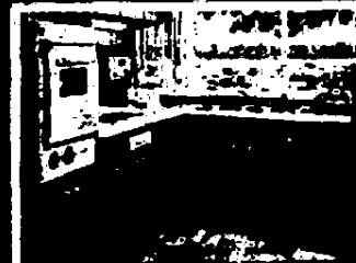
$20,000 WESTINGHOUSE VACATION HOME —with built-in Westinghouse kitchen, Spacemaker laundry equipment and clean, comfortable baseboard electric heating for carefree vacation living. This beautiful Total Electric Home: built on your land. $15,000 prize for lot if you wish.